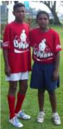
Two young hopefuls at the Coca Cola Talent Camp 2009